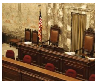
G-4 Planning Directives